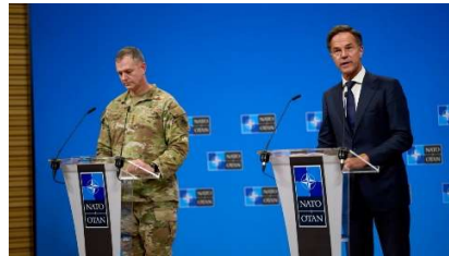
NATO Secretary General Mark Rutte (right) and NATO's Supreme Allied Commander Europe, US General Alexis Grynkeiwich at the launch of Eastern Sentry.

"Although the immediacy of our focus is on Poland, this situation transcends the border of one nation. What affects one ally affects us all," Grynkeiwich said.