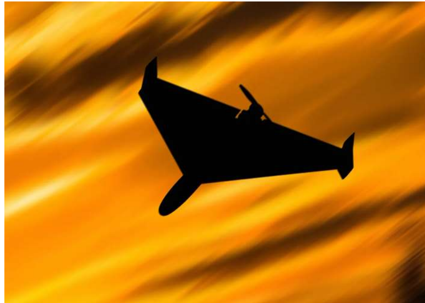
Shahed-136 drone.

Kongsberg, Patria and Nammo AS strengthen cooperation and Nordic Partnership