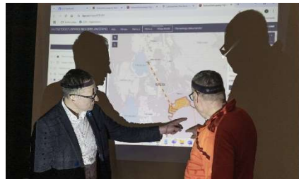
Public debate on the location of the defence industry park.

This means that the producer would have to pay a fee for storing ammunition while the state does not guarantee that it will buy it.