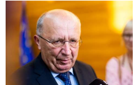
Andrius Kubilius, EU Commissioner for Defence & Space, at the European Parliament in Strasbourg.

The defence commissioner praised the "equal geographical spread" of loans through the programme, which he said demonstrated that "not only eastern frontier countries are interested" in SAFE.