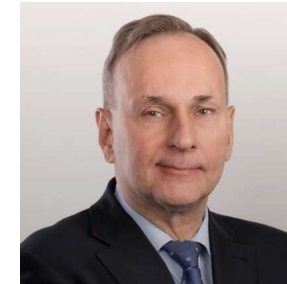
Esa Rautalinko , President and CEO of Patria

Innovation in defence is crucial for maintaining military effectiveness, technological superiority, and national security in the face of evolving threats.