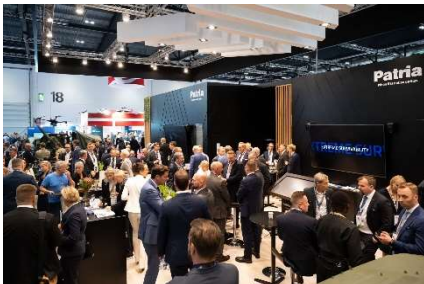
Patria, Kongsberg and Nammo held a Nordic Reception on Sep 10.

To showcase the strength and importance of the Nordic defense industry, particularly in light of Finland and Sweden's NATO membership and demonstrating the impact of Nordic collaboration, on September 10 the three companies held a Nordic Reception at the DSEI UK defense exhibition.